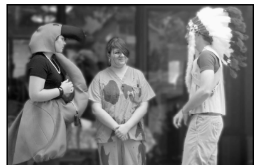
Flamingos, Chieftains, and gore, OH MY!