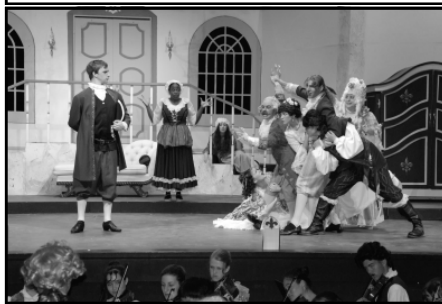
"The Eviction" scene from Tartuffe